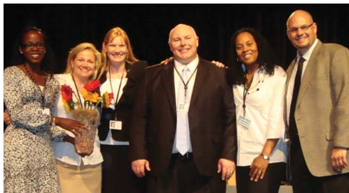
The entire admin team thanks all their parents for a great year!

Thank you all for a wonderful and successful year!