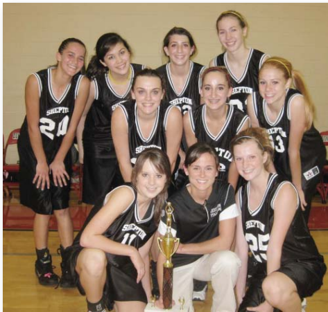
9 th A team girls basketball winning the Duncanville tournament in November, 2008. They also won the Denton tournament in December, 2008!

The Shepton Counselors here to help students in a variety of ways ranging from academic concerns to crises interventions. Please contact us if you have any questions or concerns.