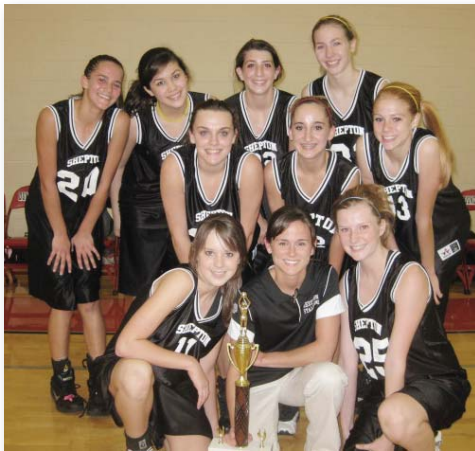
9 th A team girls basketball winning the Duncanville tournament in November, 2008. They also won the Denton tournament in December, 2008!

The Shepton Counselors here to help students in a variety of ways ranging from academic concerns to crises interventions. Please contact us if you have any questions or concerns.