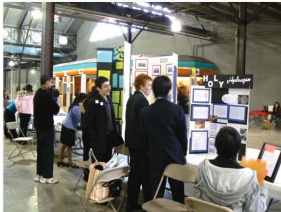
Shepton Students set up at the Regional Science Fair

at the Dallas Regional Science & Engineering Fair February 28 at Centennial Hall at Fair Park.